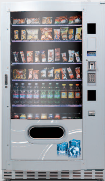
Skudo Max GCD 1050