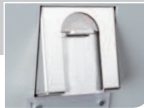
Vandal-proof coin slot