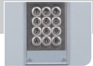
Illuminated keypad protected by 5 mm Lexan sheet