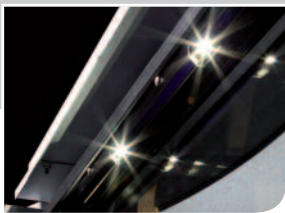
Internal lighting with side and top power LEDs